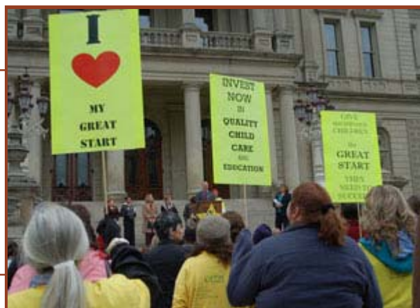
The League joined other advocates in a Capitol rally to save preschool programs for disadvantaged children